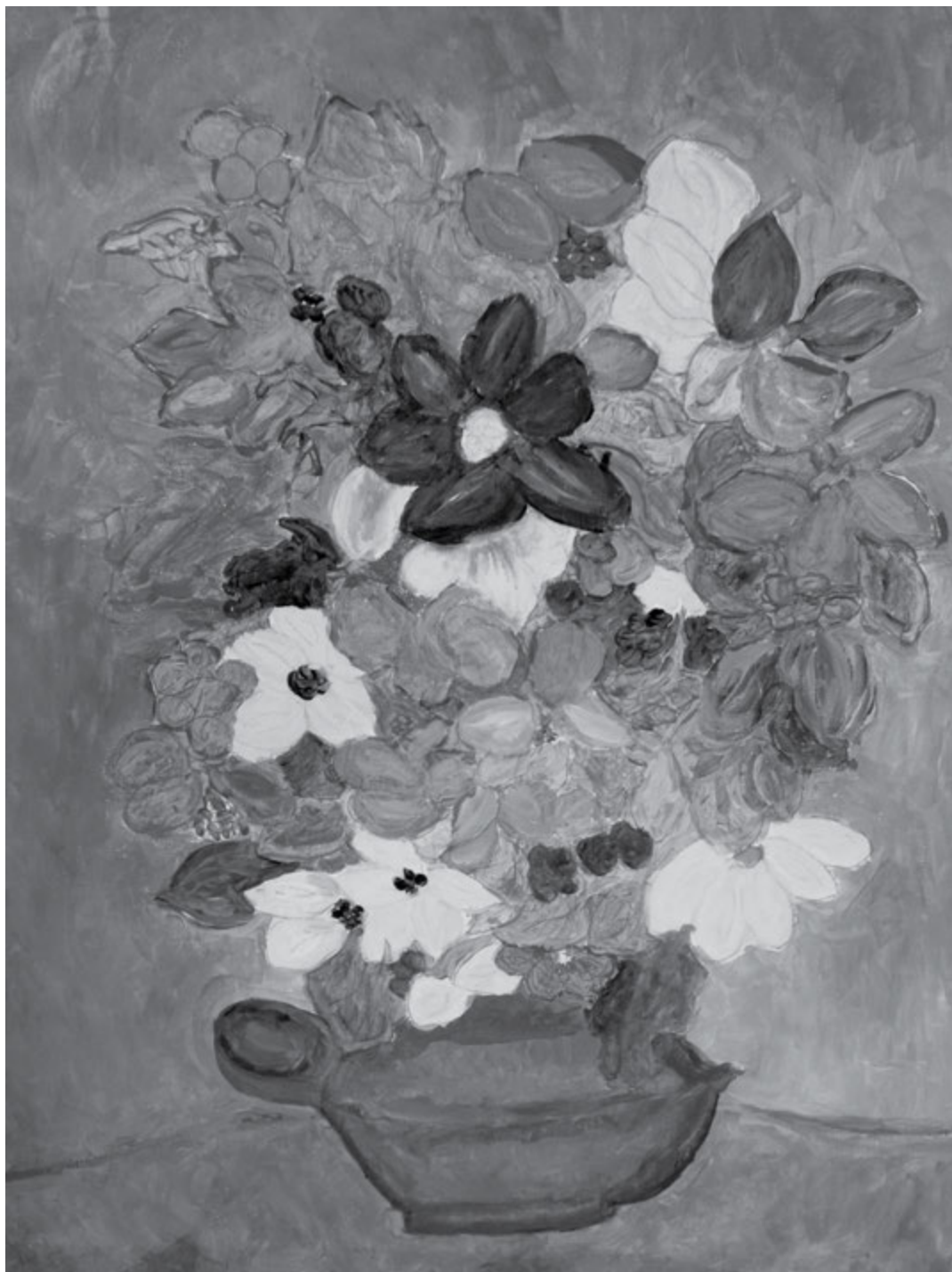
Artist: Frances Knox CDC Beachwood